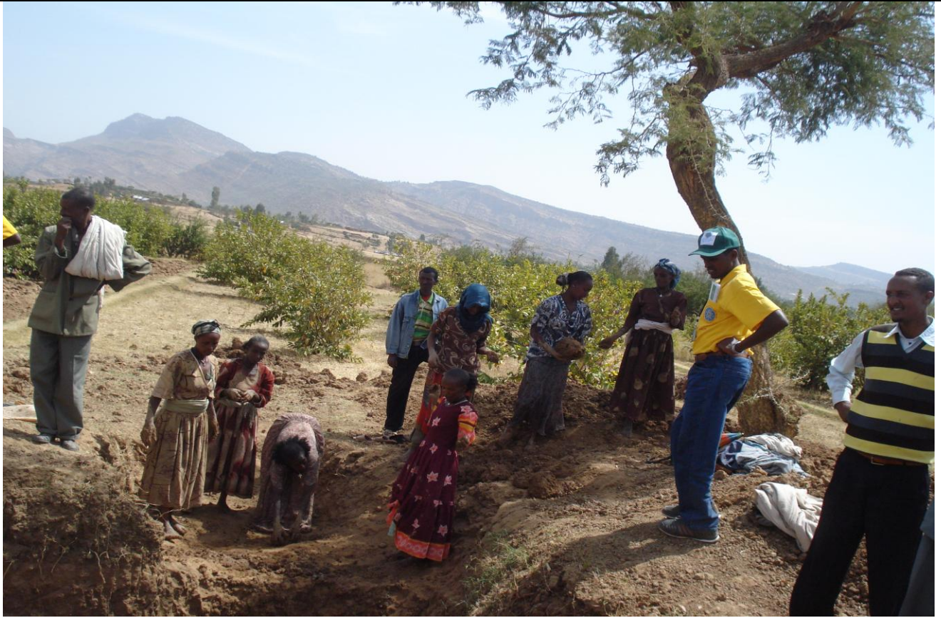
PIC 8: Community members (men & women) at soil and water conservation work