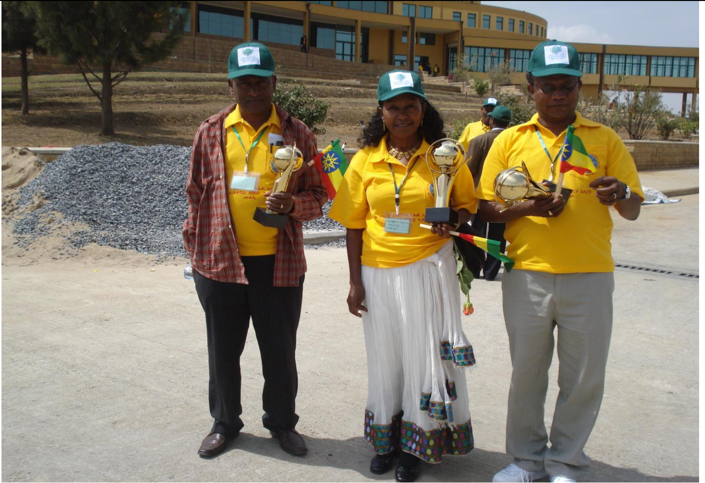
PIC 7: Investors received trophy from H;E Prime Minister