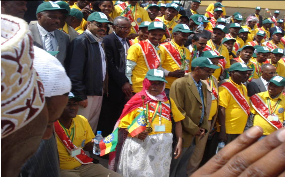
PIC 6: H: E the Prime Minister with the Awardees

The award ceremony was concluded by the closing remark of the Prime Minister. In his closing remark, H:E Ato Meles remarked that the celebration of this farmers' festival signifies the sustained development gains of the country in combating poverty. He further noted that MOARD, development practitioners, researchers, the private sector, cooperatives and Micro finance institutions have played significant role in making this gains a reality for which he thanked all very much. Finally, he assured the commitment of his government to strongly support this effort.