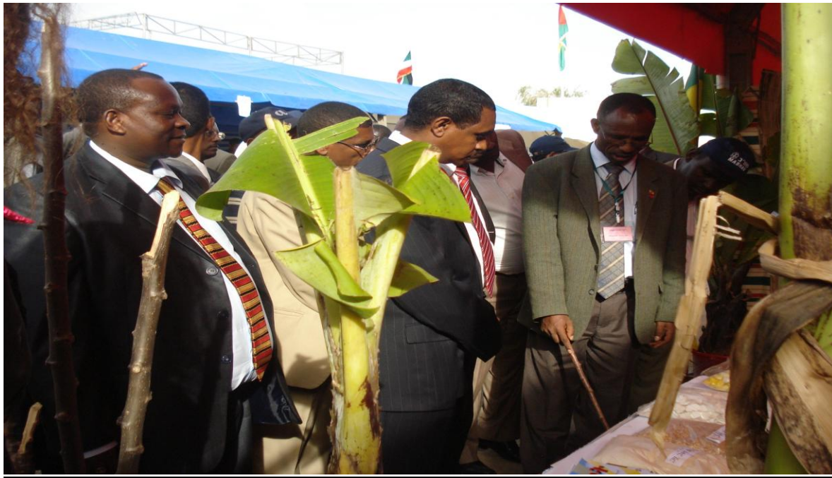
Pic 3: H:E. the minister and senior government officials visiting the exhibition