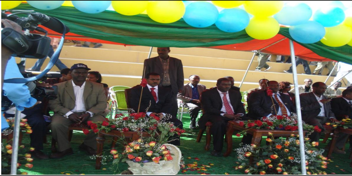
Pic 2: H:E. Ato Tefera at the exhibition opening ceremony