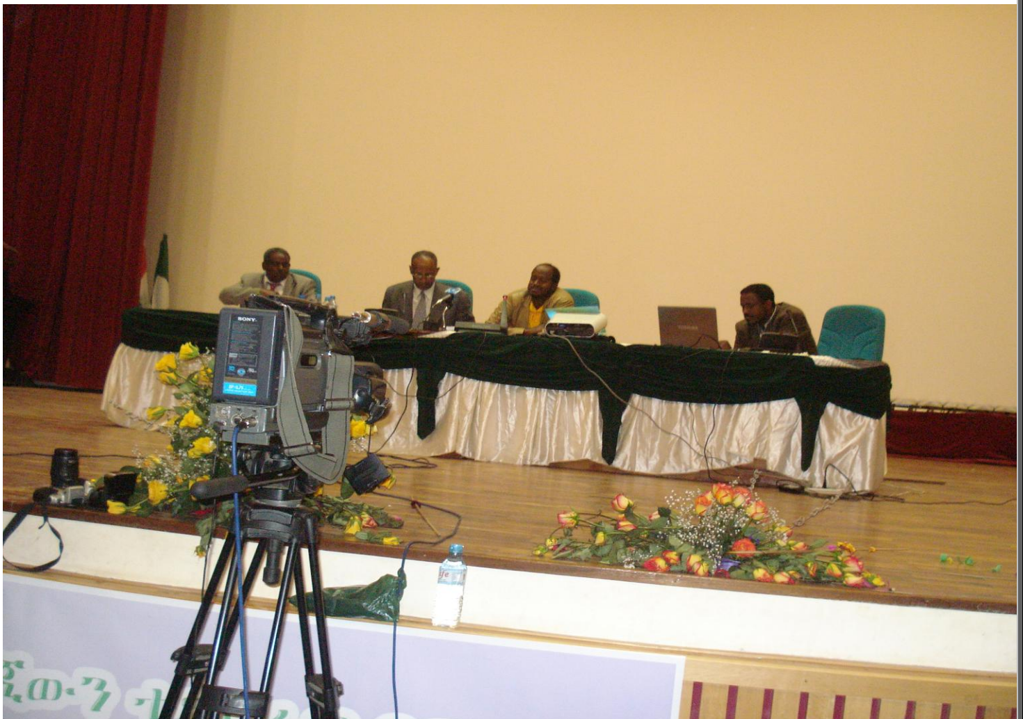
PIC 12: One of the awardees who created wealth of about 16 million Birr sharing his experience

In addition to the technical papers by senior experts from the different regions, farmers who stood 1 st from the region they come from also shared the secrets of their success.