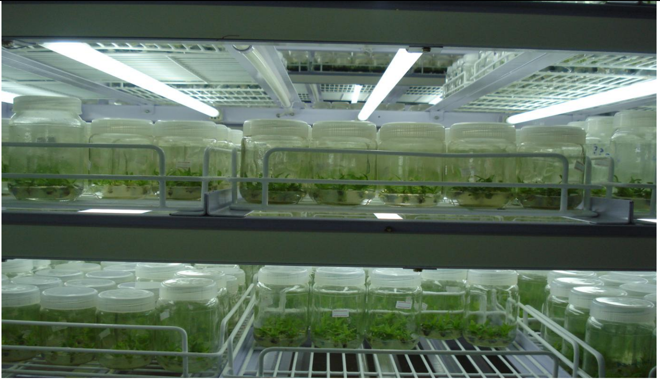
PIC 11: The plant tissue culture under production and climatization