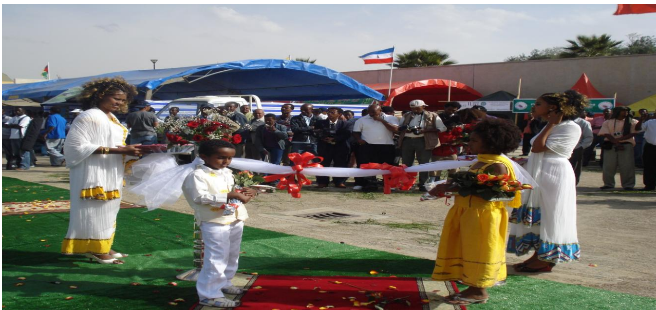
Picture1: Participants receiving the guest of honor

Questions raised by his Excellency the Minister of MOARD and visiting guests were responded by the exhibitors on the spot.