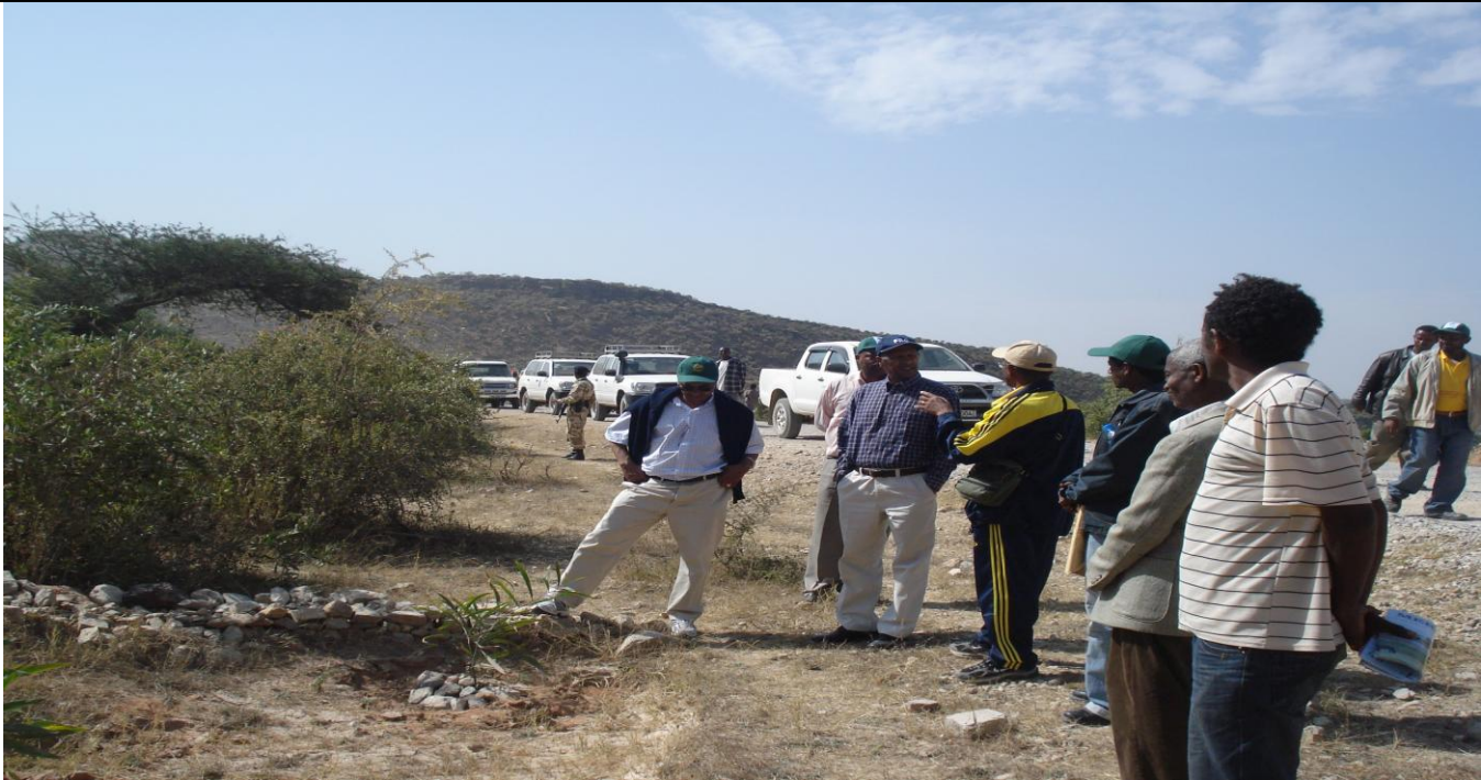
PIC 10: The visit to plant tissue culture and Abattoir